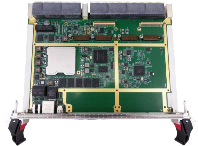
Figure 2: VPX775 Top View