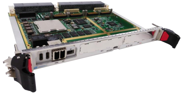
Figure 1: VPX775

Linux OS is standard on the VPX775, consult VadaTech for other options.