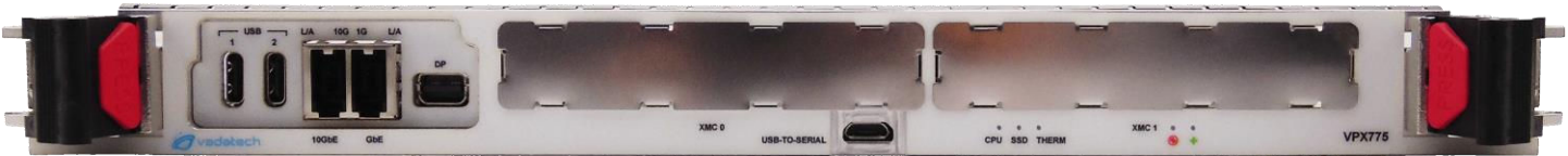
Figure 6: VPX775 Front Panel View