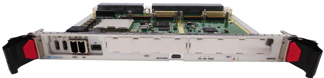
Figure 3: VPX775 Front View