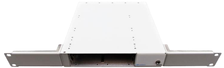
Figure 1: VT074

The VT074 chassis has right to left cooling. The chassis height is 1U and it would be installed into a 19" rack with brackets.