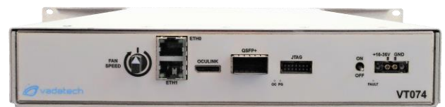
Figure 2: VT074 Rear Panel View