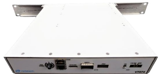
Figure 2: VT074 Rear Panel View 2