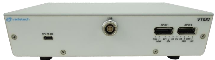
Figure 2: VT087 Front View