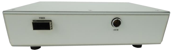
Figure 3: VT087 Rear View