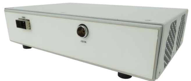
Figure 4: VT087 Rear View Alternative