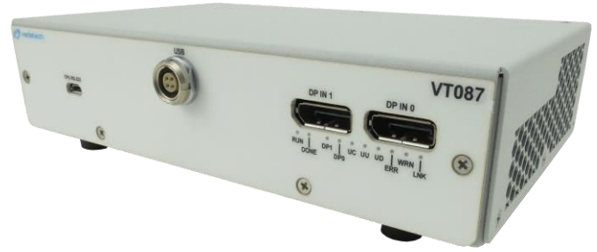
Figure 1: VT087

The VT087 is orderable with a fanless enclosure or optionally as a board-level product without enclosure. This allows customers to fully integrate the unit into their own user console.