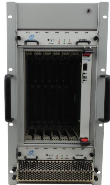
Figure 1: VTX865 Front View

There is an optional JSM to provide JTAG access to the front.