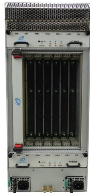
Figure 2: VTX865 Rear View