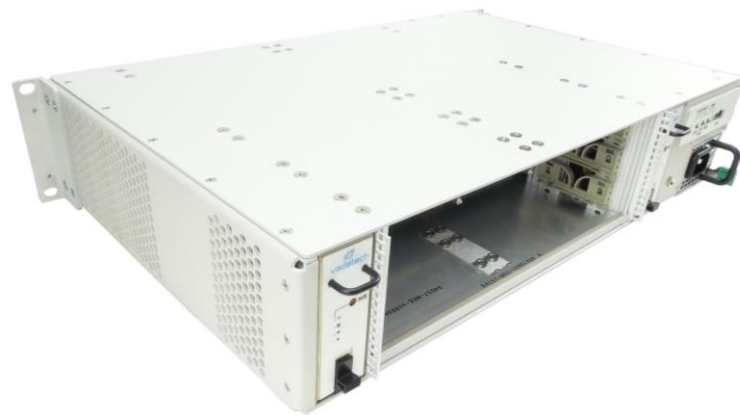
Figure 2: VTX881 Rear View