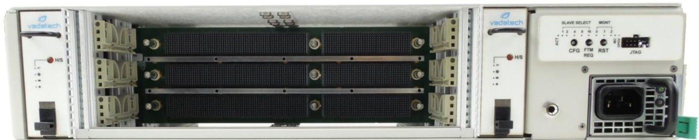
Figure 6: VTX881 Chassis Layout - Rear View with the JSM module include