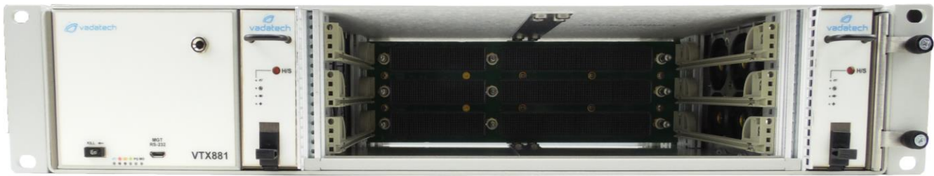
Figure 5: VTX881 Chassis Layout - Front View without the Chassis Manager