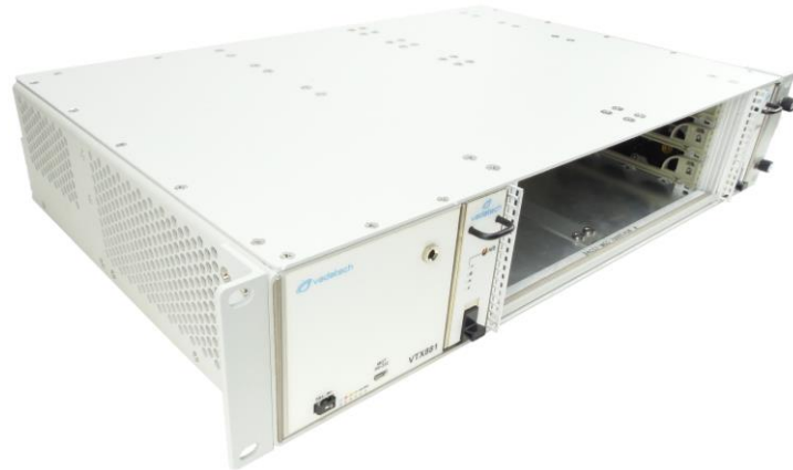
Figure 1: VTX881 Front View

The Chassis provides option for Chassis Manager which is to VITA46.11 with Tier-2 support.