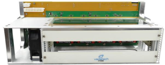
Figure 4: Chassis Layout - Rear