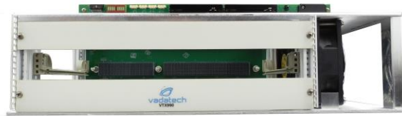
Figure 5: Chassis Layout – Front Vertical