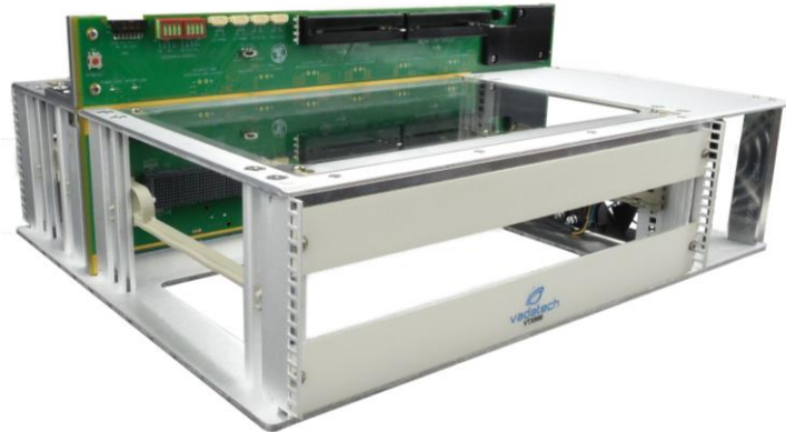
Figure 1: VTX990 Chassis Front View

The backplane breaks-out the JTAG signals via a header connector to enable external connection of a JTAG probe.