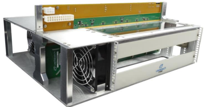
Figure 2: VTX990 Chassis Rear View