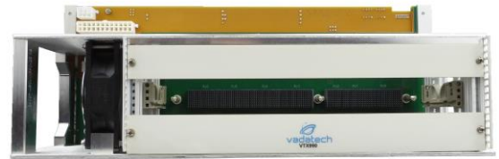
Figure 6: Chassis Layout – Rear Vertical