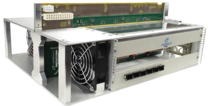
Figure 2: VTX991 Chassis Rear View