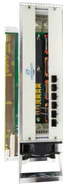
Figure 6: Chassis Layout – Rear Vertical