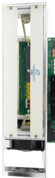
Figure 5: Chassis Layout – Front Vertical