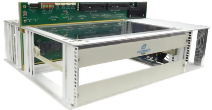
Figure 1: VTX991 Chassis Front View

The backplane breaks-out the JTAG signals via a header connector to enable external connection of a JTAG probe.