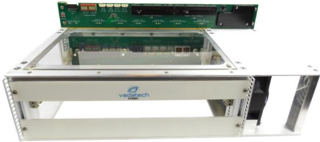
Figure 3: Chassis Layout - Front